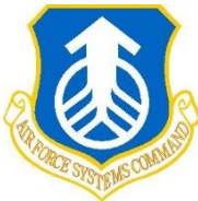
Airforce System Command B002047 30.00 0.00