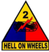
2nd Armored Division B002054 30.00 0.00