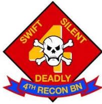
4th Recon Battalion USMC B005003 30.00 0.00