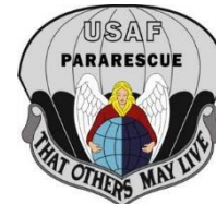
USAF Pararescue B002049 30.00 0.00