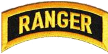
Ranger B002011 30.00 0.00