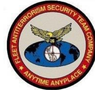
Fleet Anti-Terrorism Management Team (FAST) B004003 30.00 0.00