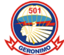
501st Geronimos B002025 30.00 0.00