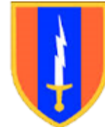
1st Signal Brigade B002026 30.00 0.00